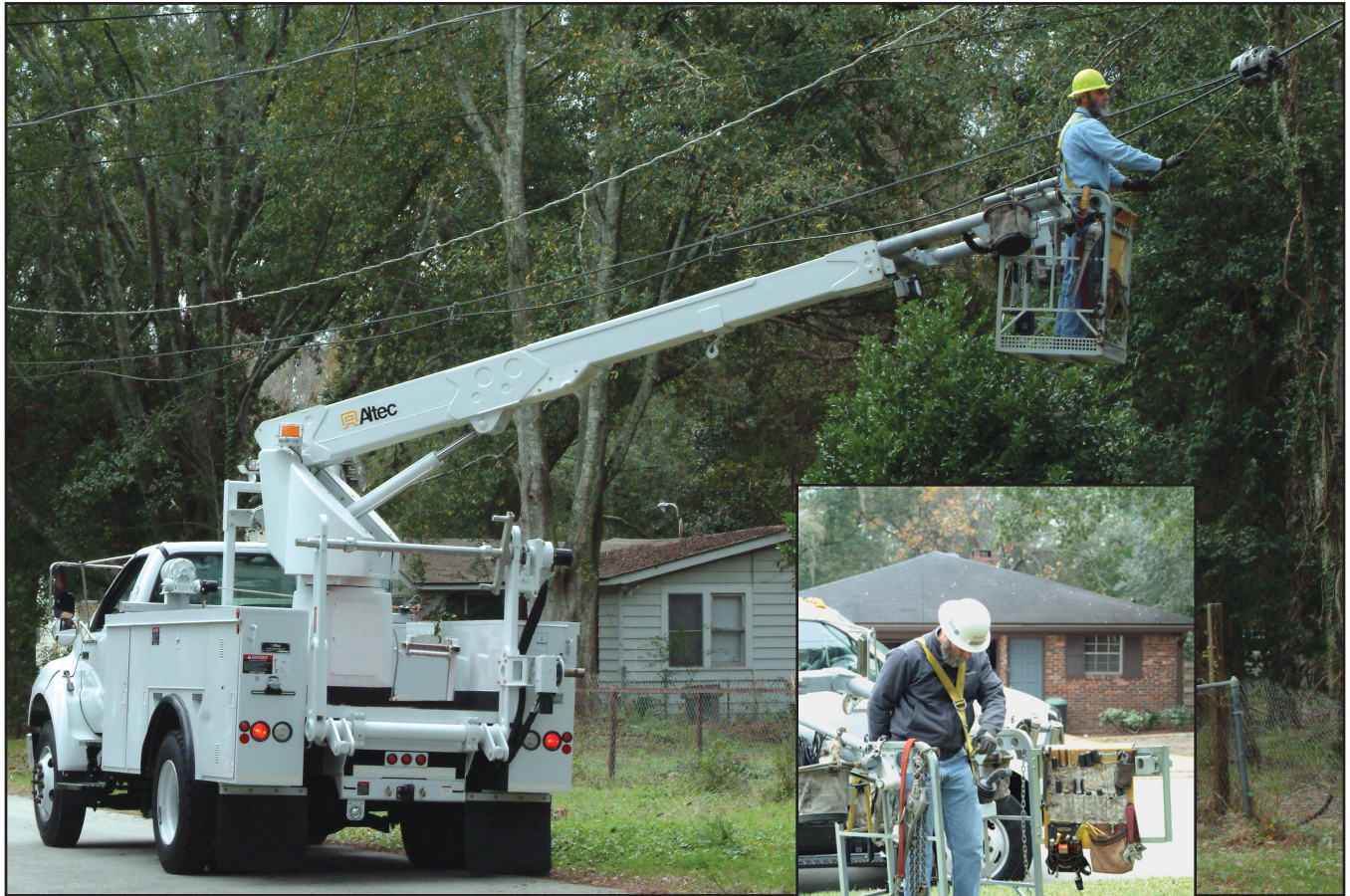
Unit Shown with Optional Cable Handling Package