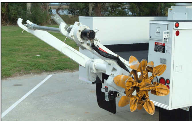
Optional Capstan Winch and 500 lb Reel Loader/Driver

Based on 40 in (1016 mm) chassis frame height