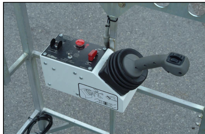
Single Handle Fully Proportional Controls