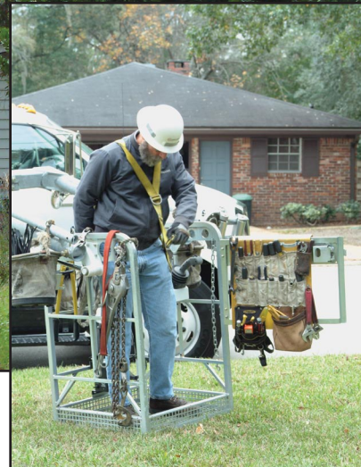
Easy Access from the Ground