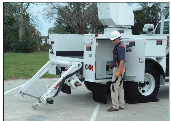
Reel Lifter Goes to Ground for Ease of Loading Reels